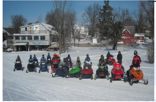
Club Ride getting under way at Jonathan's.