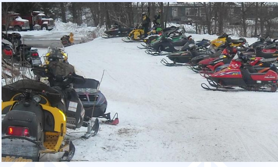
Many snowmobiles joined in the ride.