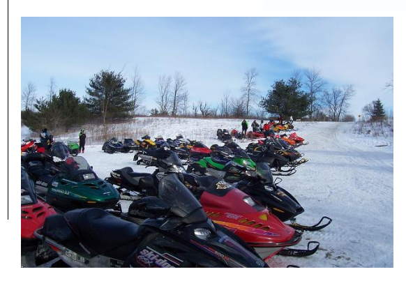
Near perfect weather for riding!