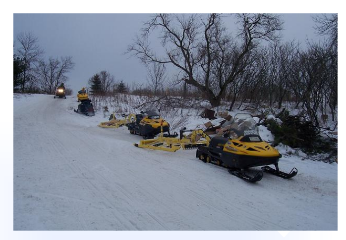
The groomer sleds saw extra duty before the ride.