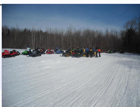
Rally point at Blue Heron Airport.