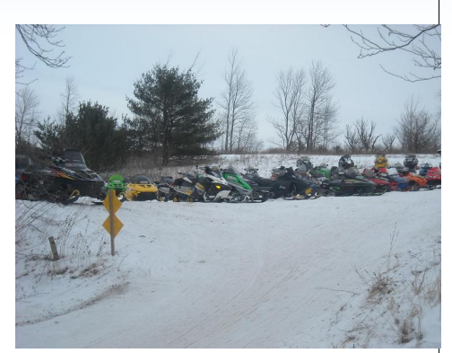
Everyone now went inside....