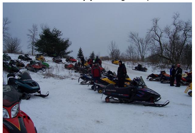
Riders from up north prepare to head back toward home.

Congratulations go out to all the winners of the door prizes and the 50/50 winner! More than 40 members took part in the Club ride!