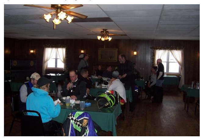
Club members enjoy hot wings and pizza!