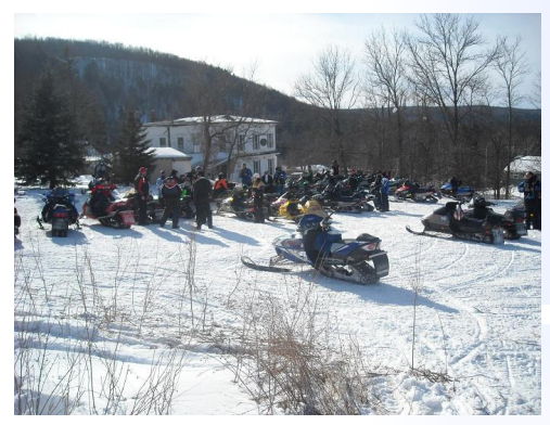
First arrivals at the Maple Inn, East Berne.